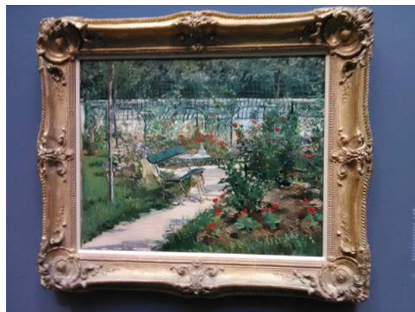
My Garden (The Bench) -Manet