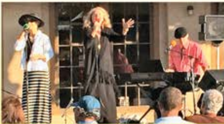
Some photos from 2016

Sponsor inquiries, talent registration and volunteers, call 310.479.2529 or email martinrubin@earthlink.net